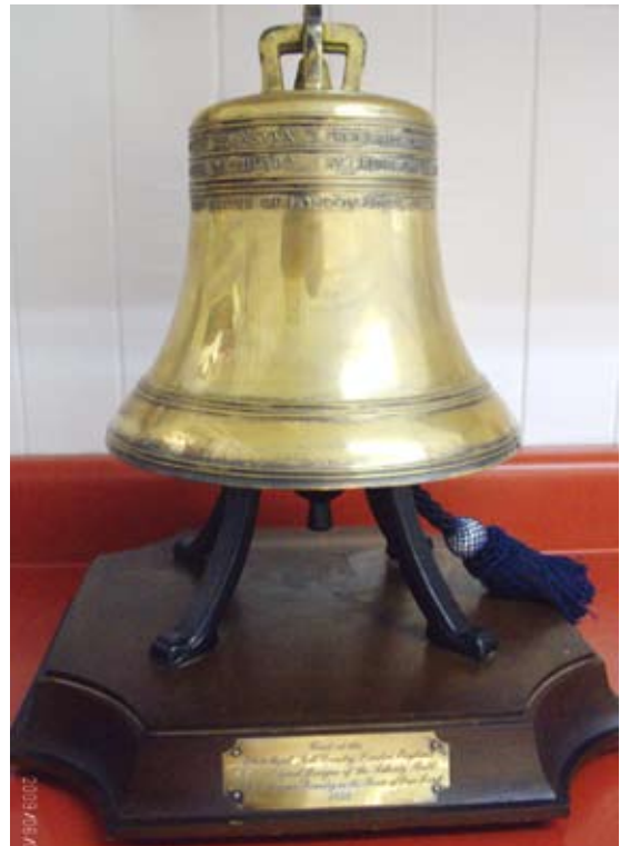
Limited Edition of the Commemorative Bicentenary Liberty Bell 1776 – 1976

See you all at the CCA Fourth of July, National Night Out and Bark in the Park. Here is to a great 2009 Summer in Naglee Park.