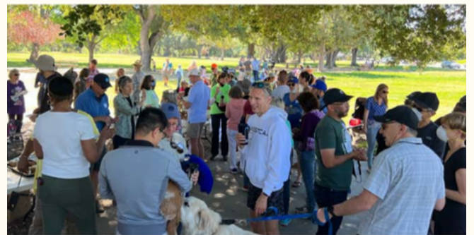
Pastries in the Park is sponsored by the Naglee Park Campus Community Association and the Beautification Committee.