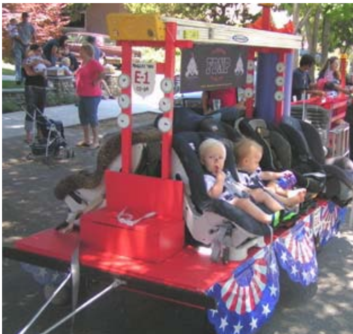
The firetruck with its little dalmations

Our parade has the typical firetruck, smiling politicians waving in convertibles, antique cars, police cars. Everyone is welcome to participate, so children and adults alike decorate all kinds of vehicles imaginable.... bicycles, tricycles, Radio Flyers, rollerbladers, skateboarders, strollers, dunebuggies, wheelchairs!