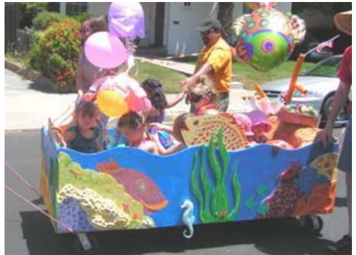
Heres some of the merkids!

The floats were lots of fun. There were 2 kids floats. The 1 year olds were dressed up in dalmation outfits, and rode in new fire engine wagons. One of the fire wagons had babies in car seats, the other had toddlers waving and tossing wather balloons, all assisted by parents. The 2 year olds had an ocean theme; partly a wagon depicting the ocean floor with the children dressed as fish and mermaids. Following it was a pirate ship, with a papier-mache mermaid at its bow. The "Women for the Preservation of Sensible Footwear in San Jose" were well represented. Political statements were made by the "Peace Not War" decorated truck, and the "Deck-adence, a trashy-by-product of Freedom".